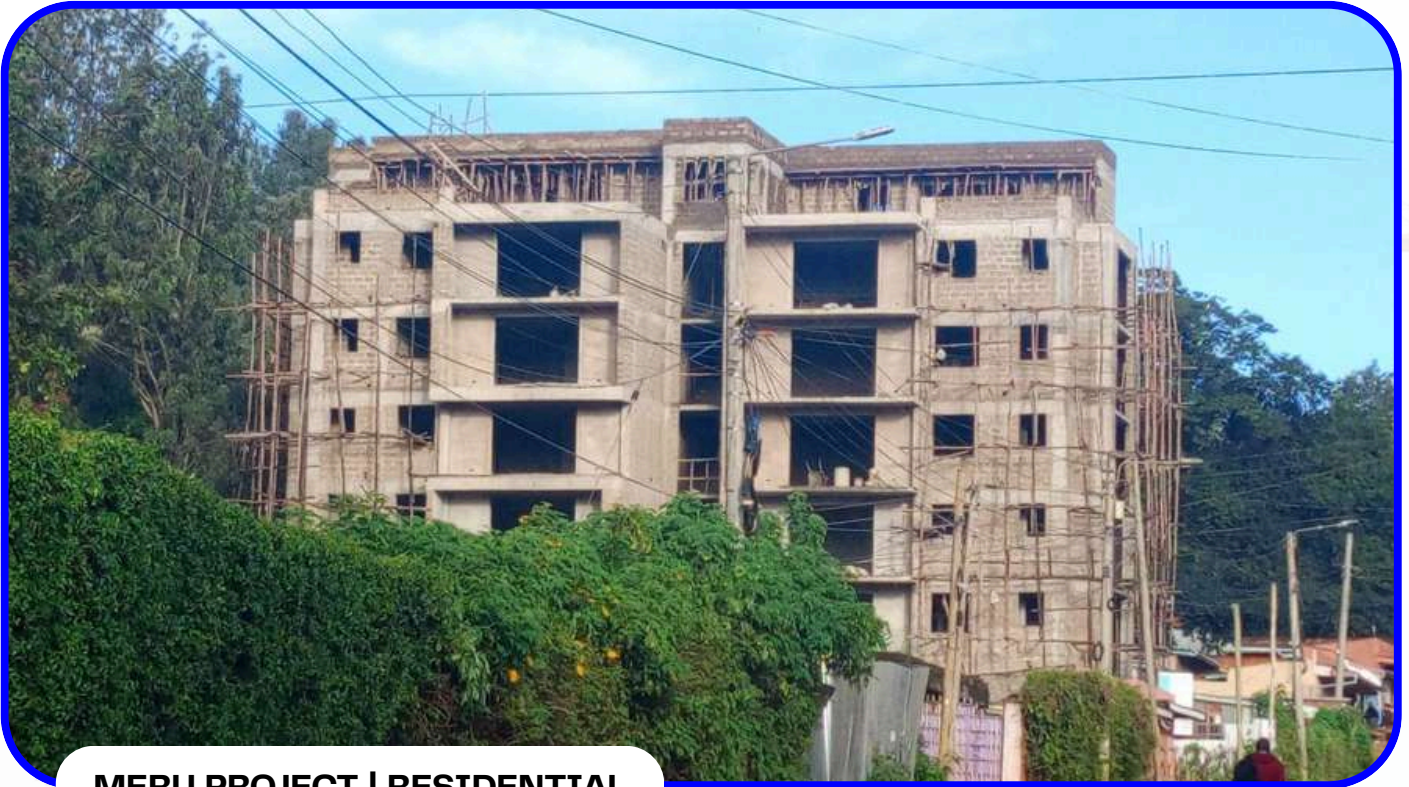
MERU PROJECT | RESIDENTIAL BUILDING MERU