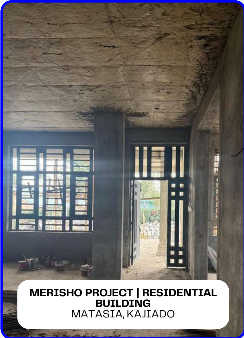
MERISHO PROJECT | RESIDENTIAL BUILDING MATASIA, KAJIADO