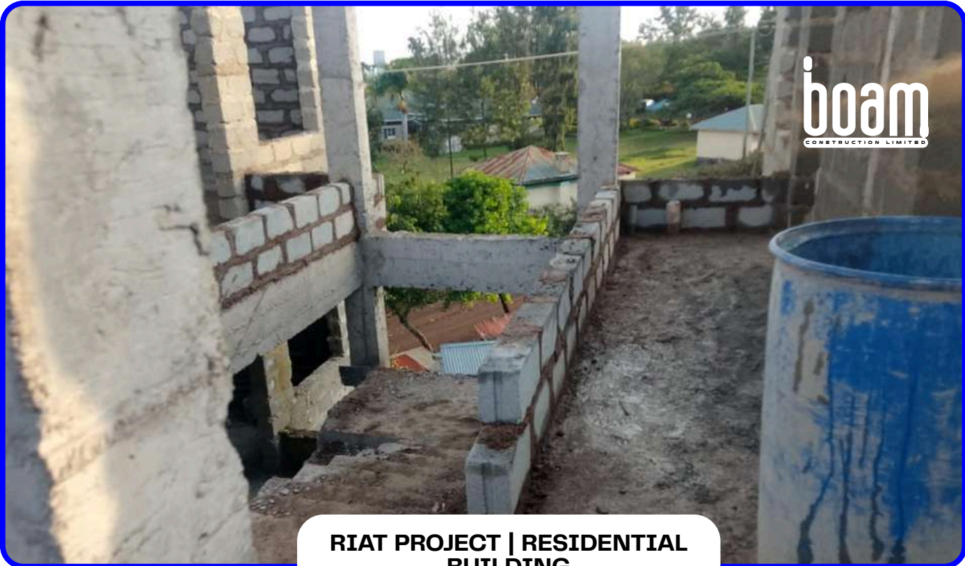
RIAT PROJECT | RESIDENTIAL BUILDING KISUMU