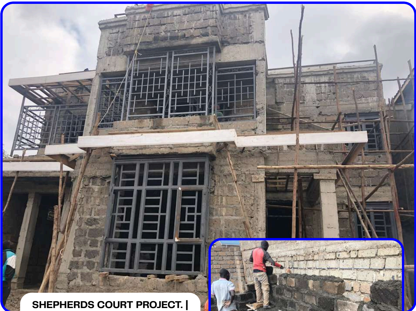
SHEPHERDS COURT PROJECT. | RESIDENTIAL BUILDING KANGUNDO RD, EMBAKASI EAST