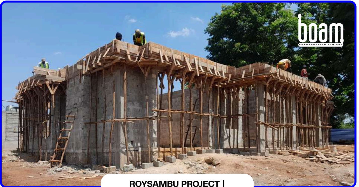
ROYSAMBU PROJECT | RESIDENTIAL BUILDING NAIROBI