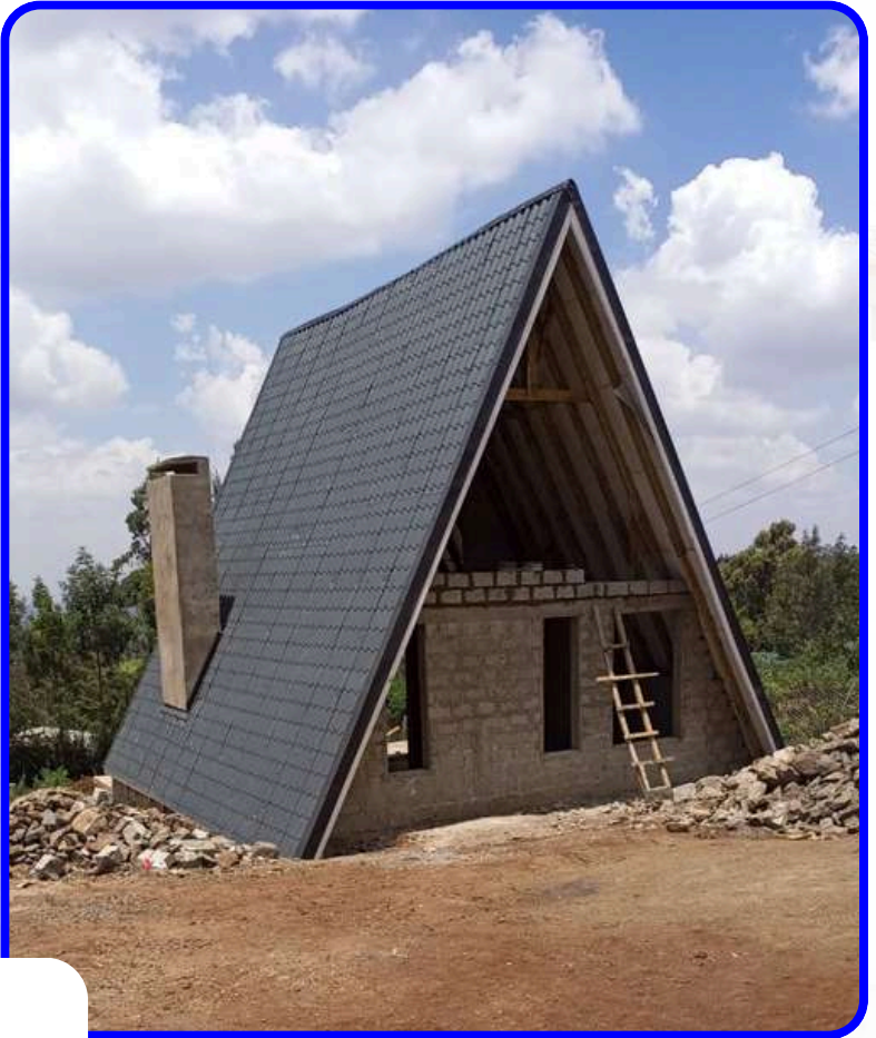
NGONG PROJECT | FRAME RESIDENTIAL STRUCTURE NGONG, KAJIADO