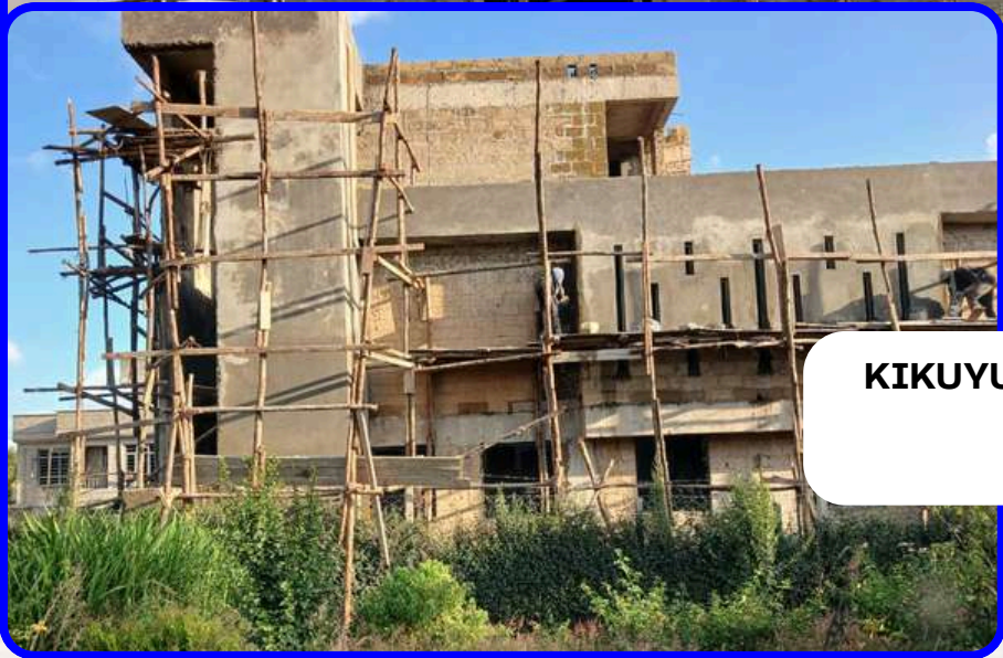
KIKUYU PROJECT | RESIDENTIAL BUILDING KIAMBU